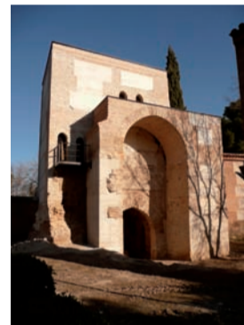
Burgos Gate, 13th century.