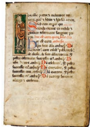
Alcalá de Henares "Fuero Viejo". 1235.

You can also make visits to the City Walls, San Lucas Square, Roman City of Complutum Forum, Roman Casa de Hippolytus and y Santa María Tower.