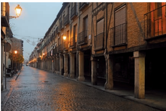
Top. Medieval Main Street virtual model in 15th century. Bottom. Medieval Main Street in 15th century.

Abd al-Salam. King Alfonso VII and Toledo Bishop Bernardo de Sedirac conquered the place for Castilla Christian Kingdom, between 1086 and 1118. Then begin Burgo de Santiuste development, in the same place of ancient Campo Laudable: urban sites and buildings of this time are just the Walls, the Episcopal Fortress, the San Justo Church (today Catedral-Magistral), the Main Street and the three towns, Christian, Muslim and Jew. In 1485 the town armature is just the same than today.