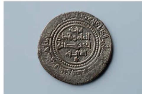
Al-Mamún islamic coin, 11th century.