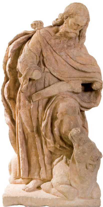
Escultura de San Lucas, siglo XVI.

of Modern one is represented by two wonderful sculptures of San Lucas and San Nicolas, dated in 16th century.