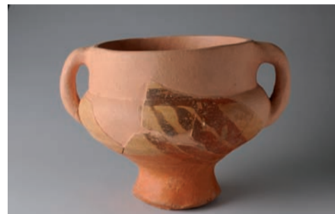
"Replación" pottery. 13th century.

Alcalá de Henares urban Medieval development began in Westgothic Late Antiquity, in the town called Campo Laudable, around the modern church Catedral – Magistral. Islamic Alcalá moved to a neighbouring hill, where they build a new border fortress called Qal'at